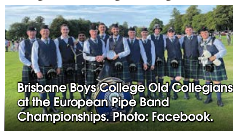
Brisbane Boys College Old Collegians at the European Pipe Band Championships.

Wonderful news from Scotland with great success for our Victorian bands competing at the European Pipe Band Championships on 11 th August in the beautiful Scottish city of Perth.