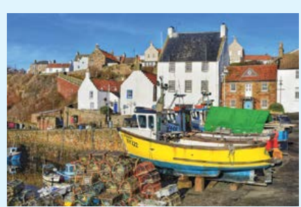
Colourful Crail Harbour, Fife.

Pose your questions on Scottish related topics to our knowledgeable readership who just may be able to help. Please keep letters under 300 words and we reserve the right to edit content and length. Letters can be emailed to info@scottishbsanner.com or online at www.scottishbanner.com/contact-us, alternatively you may post your letters to us (items posted to the Scottish Banner cannot be returned). Please ensure you include your full contact details should you require a reply. This page belongs to our readers so please feel free to take part!