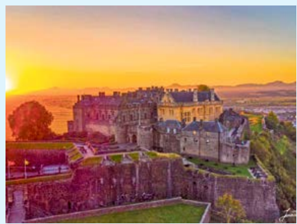
Sunset over Stirling Castle JT Photography

A look down Princes Street in Edinburgh. Have you been? The Kilted Photographer Stirling Castle