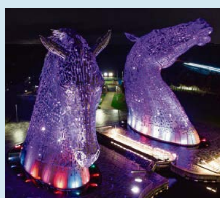
The Kelpies lit up purple