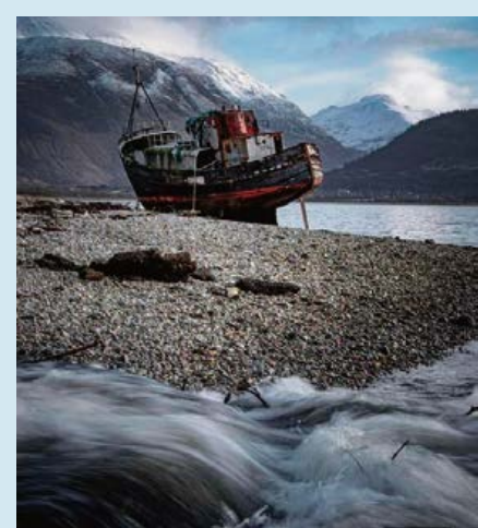
The Corpach shipwreck (fishing boat MV Dayspring ) resting on the shore of Loch Linnhe. Colfin Captures