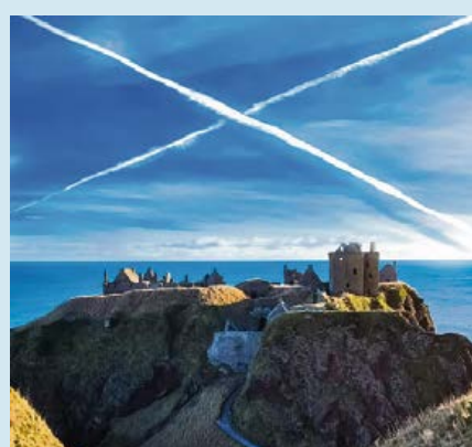
A double exposure of Dunnottar Castle and a Saltire sky.